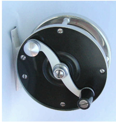
The classic styled fly reels of Gary Dabrowski

The Dabrowski fly reel is a limited production bench built game fish reel styled after the Walker and Vom Hofe reels long out of production. While classically styled, they are constructed using modern materials and finishes for improved service and durability. Not another "bar stock" or CNC reel, it is a unique piece of functional art. Each reel is the culmination of weeks of effort, carefully hand made on equipment, tools and fixtures built in his shop.